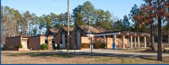
Parkwood United Methodist Church A Beacon of God's Love to All People